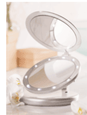
LIGHTED, MAGNIFYING MAKE-UP MIRROR