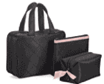
QUILTED COSMETIC BAG TRIO

RECEIVE A BONUS GIFT WITH A $500 & 2 PARTY